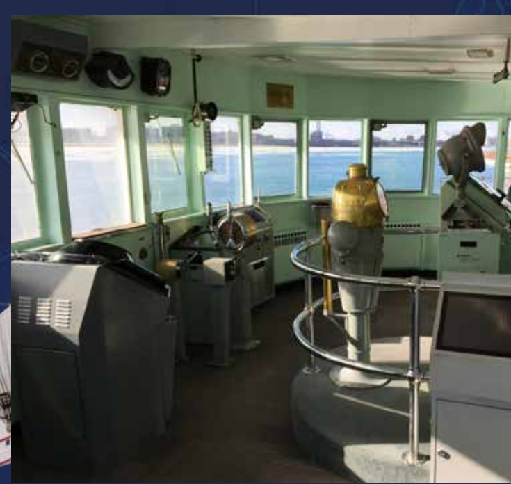
Acquiring the pilothouse of the S.S. William Clay Ford was a project of the Great Lakes Maritime Institute