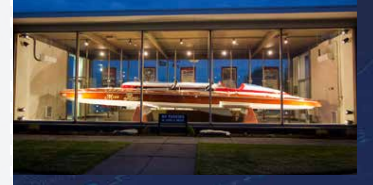
The GLMI assisted in acquisition of the historic hydroplane racing boat, Miss Pepsi . She is now on permanent display at the Dossin Great Lakes Museum